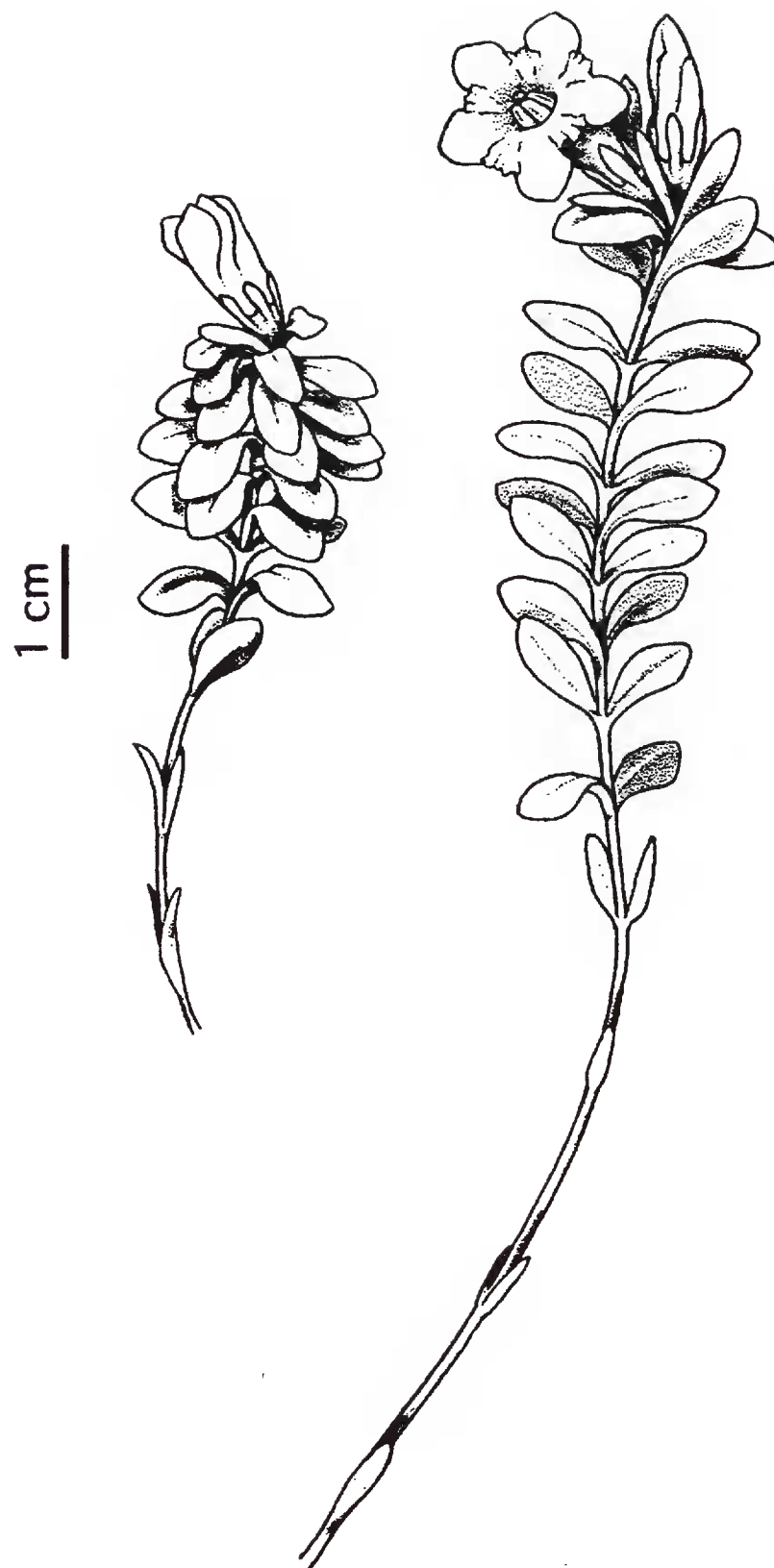
Fig. 1. Gentiana chazaroi , habit sketch of two stems. Except for the rhizome shown in Fig. 2 C, the subterranean parts of this species are unknown.